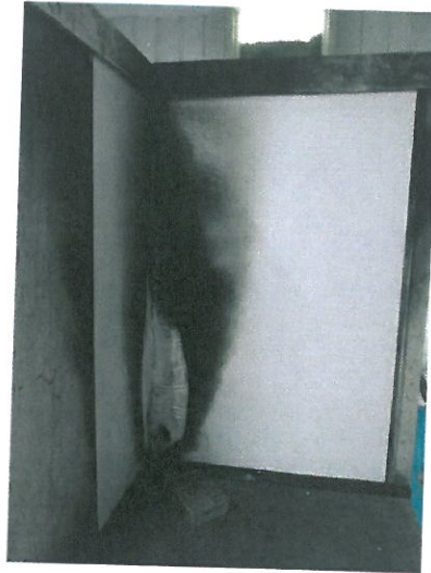
After Test (EN 13823)

Note: The above test was carried out by SGS-CSTC Standards Technical Services Co., Ltd. Shunde Branch.